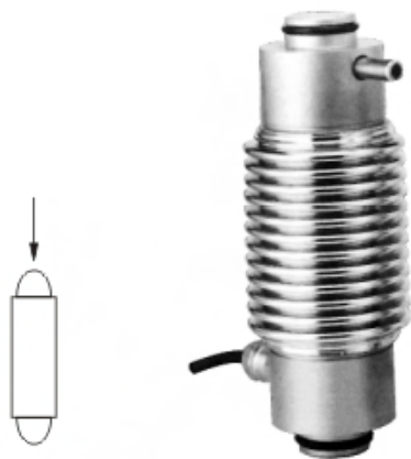
压式测力试验设备 Compression testing equipment